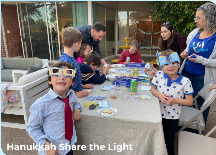
Hanukkah Share the Light

Jewish Federation is helping our community Build Jewish Resilience through civic engagement, public affairs, secure communities, and countering modern antisemitism.