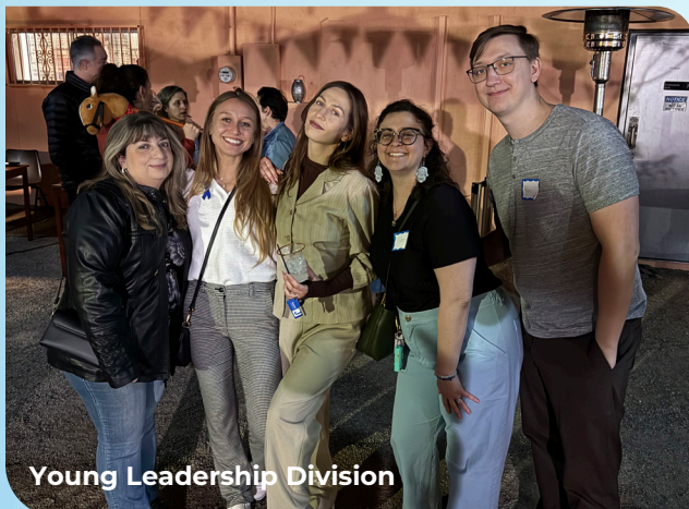
Young Leadership Division