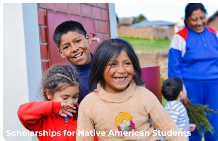
Scholarships for Native American Students

Another DAF fundholder supported the Opening Minds through the Arts (OMA) program in the Tucson Unified School District, bringing essential art and music materials to fifteen schools that otherwise lacked the resources for specialized instruction—enriching the classroom experience for hundreds of children.