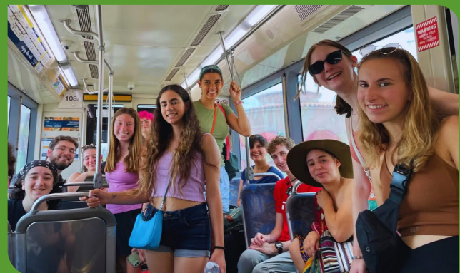
University of Arizona Hillel Foundation

U of A students thrive as part of a proud and empowered Hillel community. Support from JPSA provides Jewish students the opportunity to travel to Israel with Birthright, to provide a safe space for students to gather on campus to learn, pray, and socialize, and to have a home away from home.