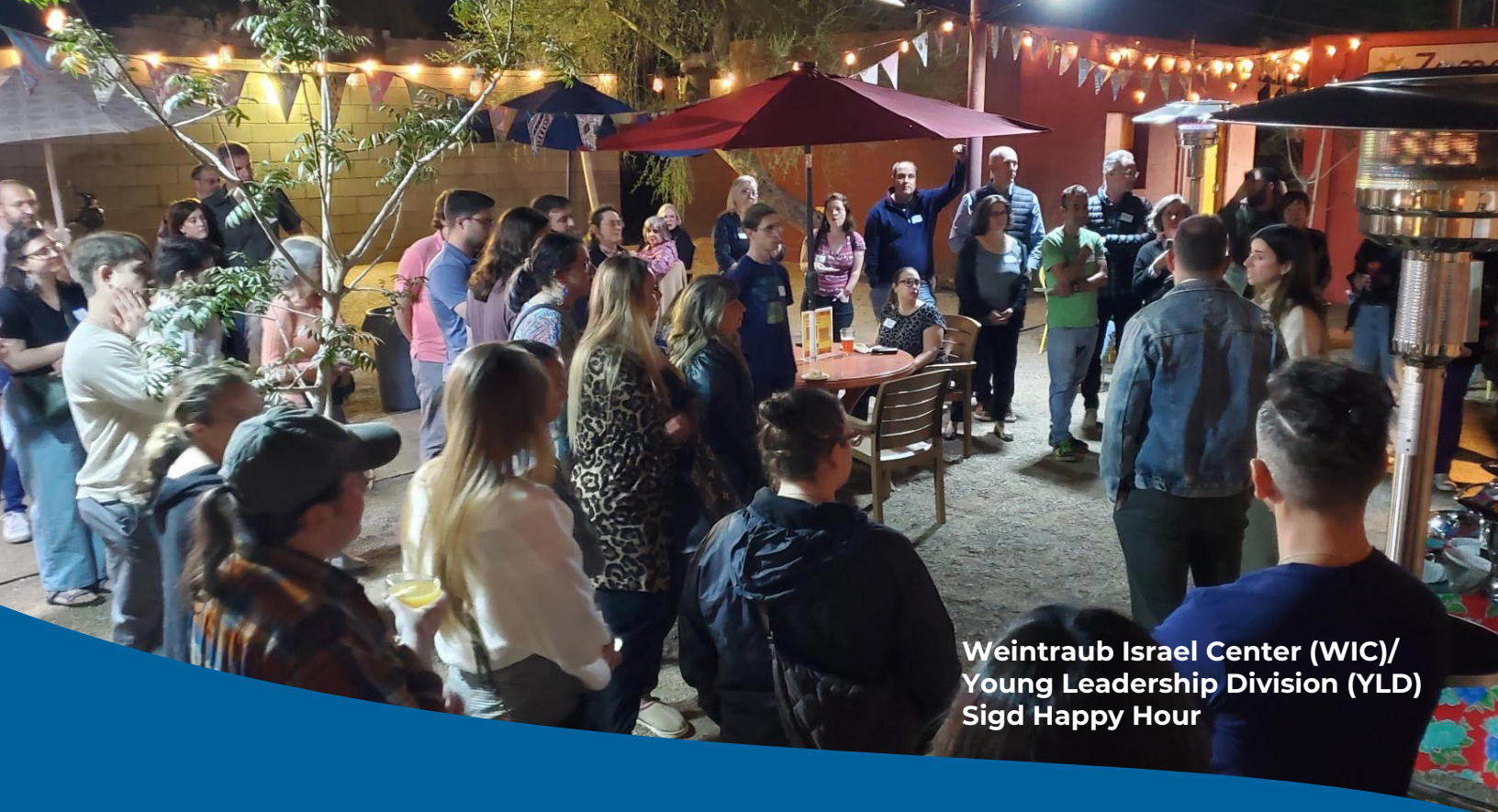
Weintraub Israel Center (WIC)/ Young Leadership Division (YLD) Sigd Happy Hour

Rooted in Jewish values, Jewish Philanthropies of Southern Arizona (JPSA) – home to Southern Arizona’s Jewish Federation and Jewish Community Foundation – seeks to inspire, galvanize and support local community members and organizations in building and sustaining a strong, caring, vibrant Jewish community for today and tomorrow.